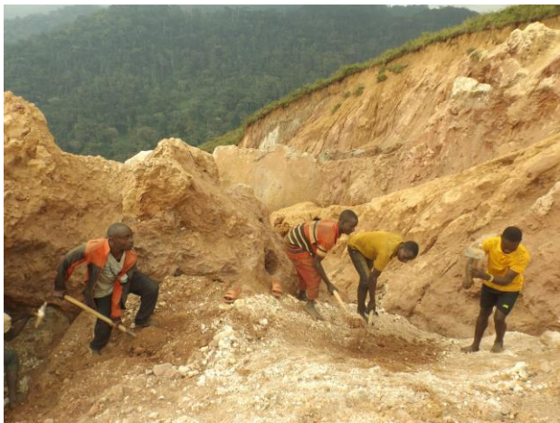
Miners at Munyinya I mine site, Bukinanyana Commune, Cibitoke Province, Burundi, June 2024

Incidents falling under 2 or more categories are not included in the total figures, however, please refer to the chart which accounts for multiple type incidents