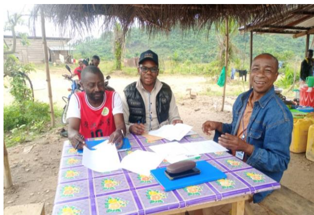
Capacity building session on joint tag and lockboxes management, Chantier 12 SI sub-sector, Maniema Province, DRC, June 2024

More information available at http://itsci.org including: Company Audits; Governance Assessments; Data Summaries; Data Disclosure Policy; Membership Details; Annual Reports by Implementation Region; and Information on ITSCI Governance structures and Mechanisms.