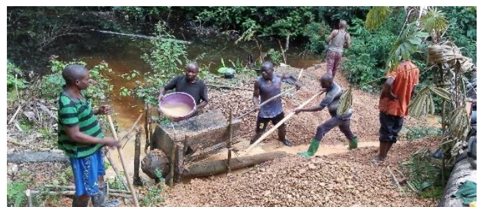
Washing of minerals at Ndelele sub-sector, Pangi territory, Maniema Province, DRC, May 2024