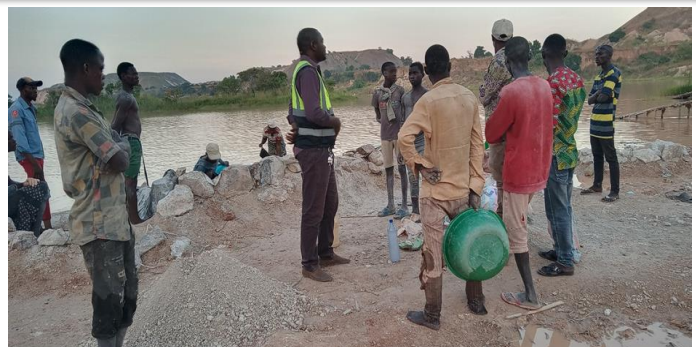
ITSCI Field Officer raising awareness on the risks and prohibition of child labour, Tanganyika Province., DRC, May 2024