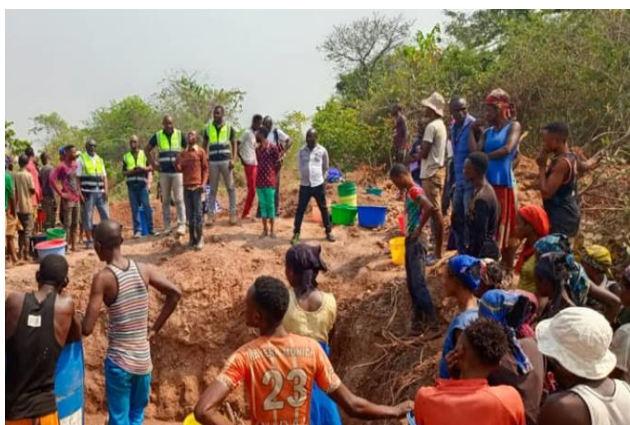
Awareness Raising Session on the prohibition and risks of child labour in the mines, Kamikenke sub-sector, Haut-Lomami Province, DRC, June 2024

During the second quarter of 2024, ITSCI organised 200 training, coaching, and awareness raising events in the DRC, Rwanda, and Burundi, benefitting 4,839 local stakeholders – 887 women and 3,952 men – in total.