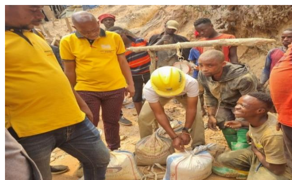
Bags being tagged by SAEMAPE following the tagging extension in Lugushwa, South Kivu Province, DRC, September 2023 (right)