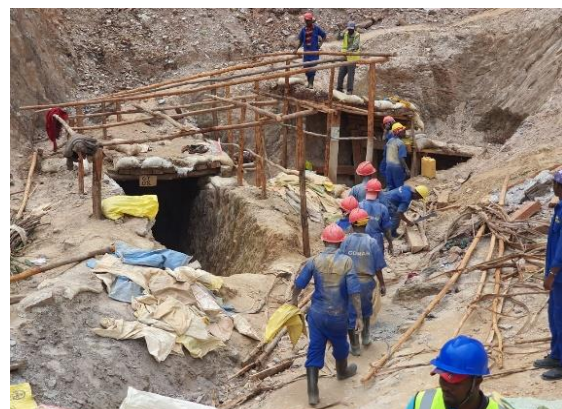
Tunnels design and roofing at Gitima site, Comar company, Rwanda, October 2023 (top right)