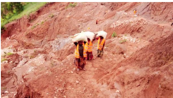
Women transporters at Kasenyamisange II site, Ngozi Province, Busiga Commune, Burundi, December 2023 (top left)

Incidents falling under 2 or more categories are not included in the total figures, however, please refer to the chart which accounts for multiple type incidents