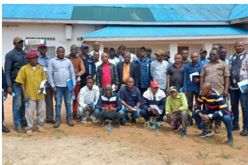
Training of SAEMAPE, Divimines, and PMH on joint tagging management. Nyunzu territory, Tanganyika Province, December 2023.

During the last quarter of 2023, ITSCI organised 143 training, coaching, and awareness-raising events in the DRC, Rwanda, and Burundi, benefitting 4,085 local stakeholders – 575 women and 3,510 men – in total.