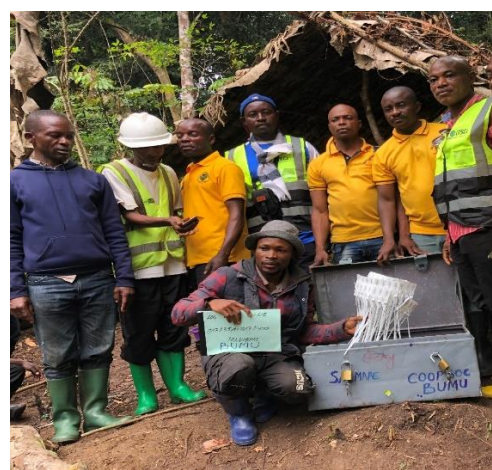
Launch of tagging at Bumu site, Maniema Province, DRC, October 2023

More information available at http://itsci.org including: Company Audits; Governance Assessments; Data Summaries; Data Disclosure Policy; Membership Details; Annual Reports by Implementation Region; and Information on ITSCI Governance structures and Mechanisms.