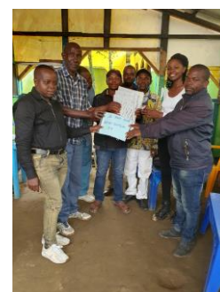
Launch of ITSCI tagging procedures at Kasaka sub-sector, Mwenga territory, South Kivu, March 2023 (below)

More information available at http://itsci.org including: Company Audits; Governance Assessments; Data Summaries; Data Disclosure Policy; Membership Details; Annual Reports by Implementation Region; and Information on ITSCI Governance structures and Mechanisms.