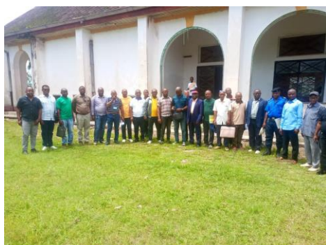
Participants of the CLS in Kalima, Maniema, March 2023 (below)

During the first quarter of 2023, ITSCI organised 251 training, coaching, and awareness-raising events in the DRC, Rwanda, and Burundi, benefitting 3,592 local stakeholders – 442 women and 3,150 men – in total.