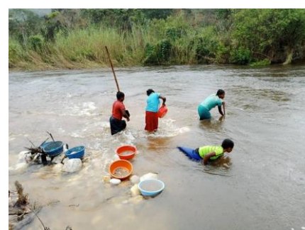
Women miners looking for mineralised sands in the Kabuvwe river, at Kabinungie sub-sector, Mitwaba territory, Haut-Katanga, March 2023 (right)