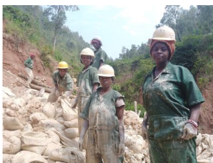
Women miners at Rwesero site, Eprocomi, Rwanda March 2023 (top left)

Incidents falling under 2 or more categories are not included in the total figures, however, please refer to the chart which accounts for multiple type incidents