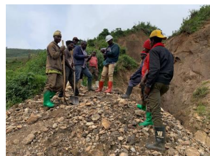
ITSCI meeting with miners, Kamatale sub-sector, Ngungu, Masisi Territory, North Kivu February, 2023 (top right)