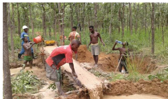
Miners washing mineralised sands in the Kamola sub-sector Haut-Lomami, September 2022 (right)