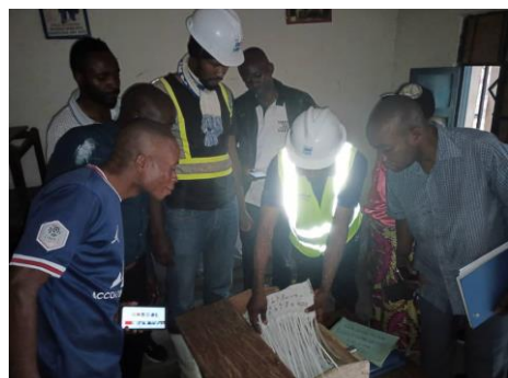
SAEMAPE receiving ITSCI materials for lockboxes at Nyambembe site, Shabunda territory, South Kivu September 2022 (top right)