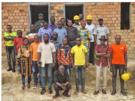
CLS meeting with stakeholders in Mungembe, Shabunda territory, South Kivu, September 2022 (top left)

Incidents falling under 2 or more categories are not included in the total figures, however, please refer to the chart which accounts for multiple type incidents