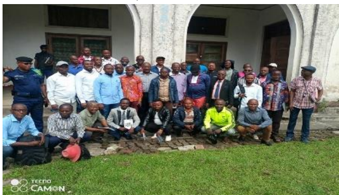
Capacity building session on due diligence, Kalima, Maniema, August 2022 (below)

During the second quarter of 2022, ITSCI organised 169 training, coaching, and awareness-raising events in the DRC, Rwanda, and Burundi, benefitting 3,903 local stakeholders – 470 women and 3,433 men – in total.