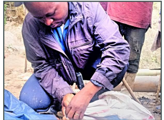
ITSCI training on due diligence at Funga Mwaka site, Kalehe territory, South Kivu, February 2022 (top left)