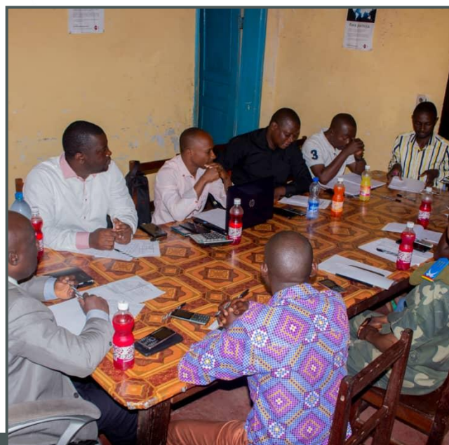
CLS participants in Luena, Bukama territory, Haut-Lomami province January 2022 (below)

More information available at http://itsci.org including: Company Audits; Governance Assessments; Data Summaries; Data Disclosure Policy; Membership Details; Annual Reports by Implementation Region; and Information on ITSCI Governance structures and Mechanisms.