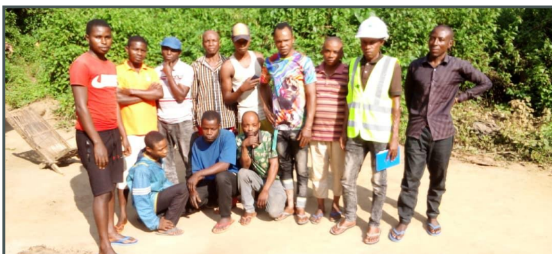
Joint field visit with SAEMAPE to Nsolo site, Pangi territory, Maniema, January 2022 (above)

During the first quarter of 2022, ITSCI organised 241 training, coaching, and awareness-raising events in the DRC, Rwanda, and Burundi, benefitting 3,617 local stakeholders in total.