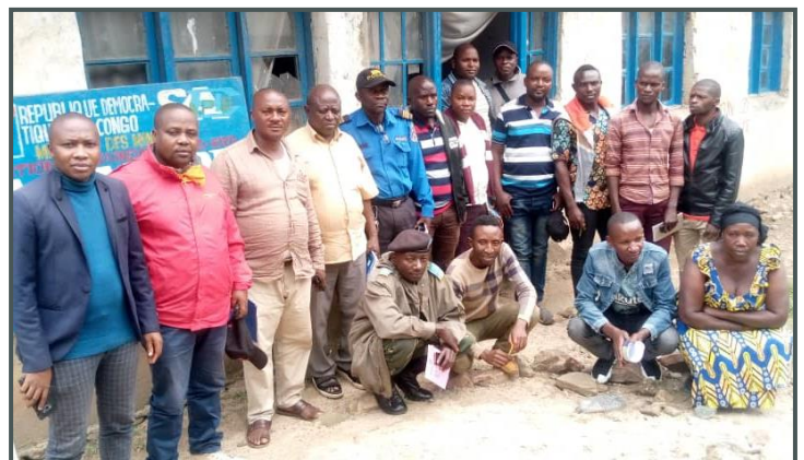
Nyamukubi CLS members after a meeting, Kalehe territory, South Kivu, January 2022 (right)