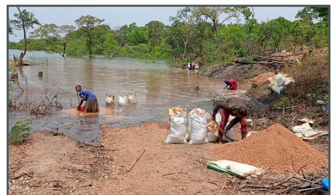
ITSCI field staff with SAEMAPE agents and miners at Kalambo sub-sector, Mitwaba territory, Haut-Katanga, September 2021 (left) Artisanal miners wash mineralised sand at Funga Buya 1 sub-sector, Lubudi territory, Lualaba, September 2021 (right)