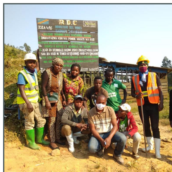
SAEMAPE, Divimines, and ITSCI agents during a joint visit to Kalimbi site, Kalehe territory, South Kivu, July 2021 (right)

More information available at http://itsci.org including: Company Audits; Governance Assessments; Data Summaries; Data Disclosure Policy; Membership Details; Annual Reports by Implementation Region; and Information on ITSCI Governance structures and Mechanisms.