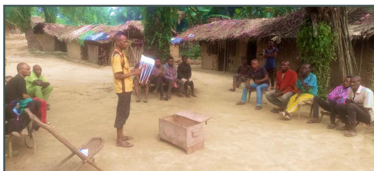
Provisioning the lockbox for joint tag management at Nyaogubu site, Lubutu territory, Maniema, July 2021 (above)