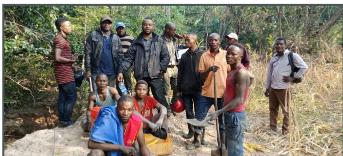
SAEMAPE, Divimines, and ITSCI agents during a joint visit to Katamba 2 mine, Manono territory, Tanganyika in June 2021 ( above )