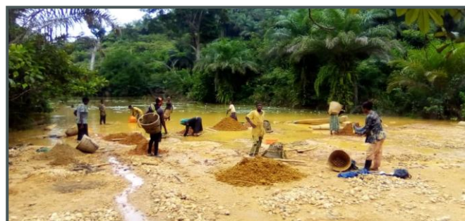
Washing mineralised sand at Kabeya mine, Pangi territory, Maniema May 2021 ( right )

More information available at http://itsci.org including: Company Audits; Governance Assessments; Data Summaries; Data Disclosure Policy; Membership Details; Annual Reports by Implementation Region; and Information on ITSCI Governance structures and Mechanisms.