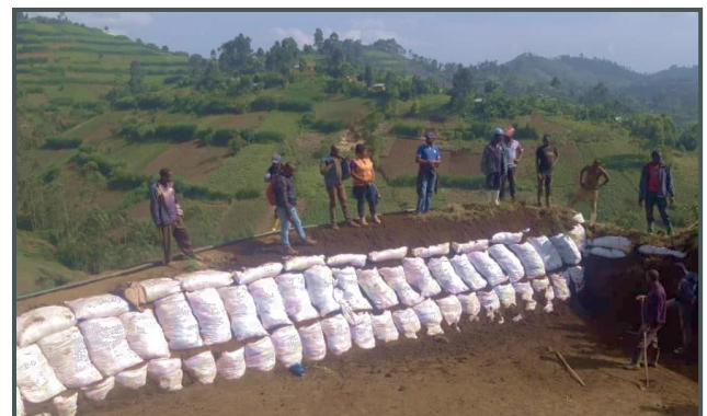
Divimines and SAEMAPE participants in a technical training on ITSCI traceability in Punia territory, Maniema, April 2021 (left) Artisanal miners construct a retaining pool at Bihula sub-sector, Masisi territory, North Kivu, June 2021 (right)