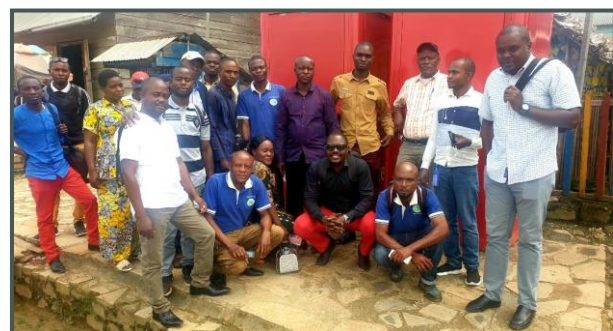
Miners examine extracted sand in Pangi territory Maniema in December 2020 (left) Group photo with SAEMAPE and Divimines agents after an ITSCI training in Walikale territory, North Kivu, November 2020 (right)