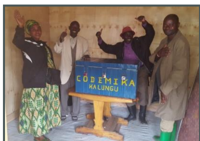
Cooperative members celebrate the installation of a lockbox for joint tag management, Numbi sector, South Kivu, December 2020