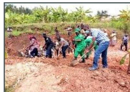
ITSCI and RMB take part in community work called Umuganda in the Ruhango district of Rwanda, October 2020

More information available at http://itsci.org including: Company Audits; Governance Assessments; Data Summaries; Data Disclosure Policy; Membership Details; Annual Reports by Implementation Region; and Information on ITSCI Governance structures and Mechanisms.