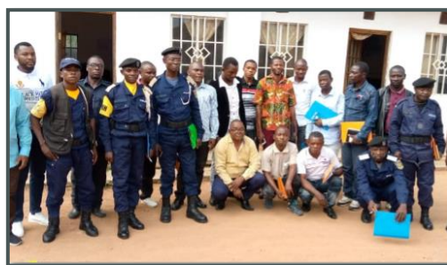
Participants at an awareness-raising session on risks associated with child labour in Malemba-Nkulu, Haut-Lomami in November 2020