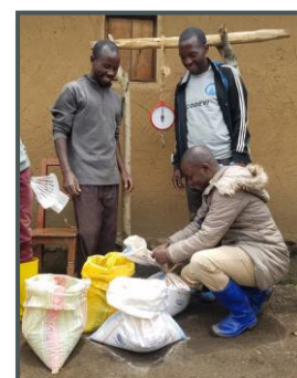
Tagging launched at a new mine site in Masisi Territory, North Kivu Province, September 2020

More information available at http://itsci.org including: Company Audits; Governance Assessments; Data Summaries; Data Disclosure Policy; Membership Details; Annual Reports by Implementation Region; and Information on ITSCI Governance structures and Mechanisms.