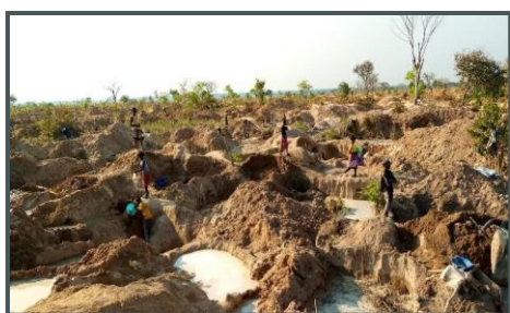
Washing mineralised sand in Manono Territory, Tanganyika Province, September 2020