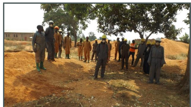
ITSCI training exporters and state services on due diligence in Bukavu, South Kivu Province, August 2020 (left) ; Artisanal miners gather in Kirundo Province, Burundi, August 2020 (right)