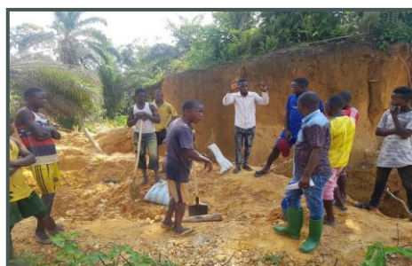
Discussions or artisanal mining teams on rotation due to water shortages in Pangui Territory, Maniema Province, September 2020