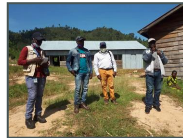
Discussion of hygiene measures against the COVID-19 pandemic, Idjwe sector, South Kivu province, June 2020

More information available at http://itsci.org including: Company Audits; Governance Assessments; Data Summaries; Data Disclosure Policy; Membership Details; Annual Reports by Implementation Region; and Information on ITSCI Governance structures and Mechanisms.