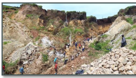
A field visit to an artisanal mining site in Masisi territory, North Kivu province, May 2020