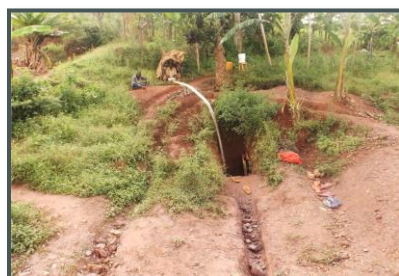
A handwashing station at an artisanal mine in Kirundo province, Burundi, April 2020