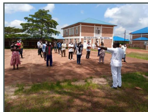
Awareness-raising sessions about hygiene measures to combat the spread of COVID-19 for artisanal miners in Punia territory, Maniema province, DRC (left) and at a cooperative in Gakenke district in Rwanda (right), May 2020